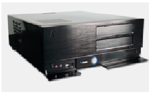
2 x 5.25", 1 x 3.5", 2x Audio, 2x USB and Firewire connectors in front