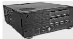
Standard power supply and ATX main board support