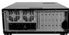
Space for up to 5 fans for perfect ventilation and cooling